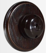
Dark Oak .DO

Can be available as a special order in Ash - Call to order.