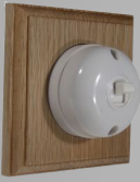
Unfinished Oak .UO