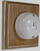
Limed Oak .LO