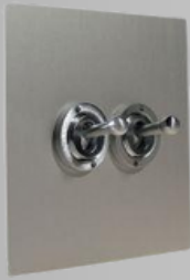
Brushed Satin Silver